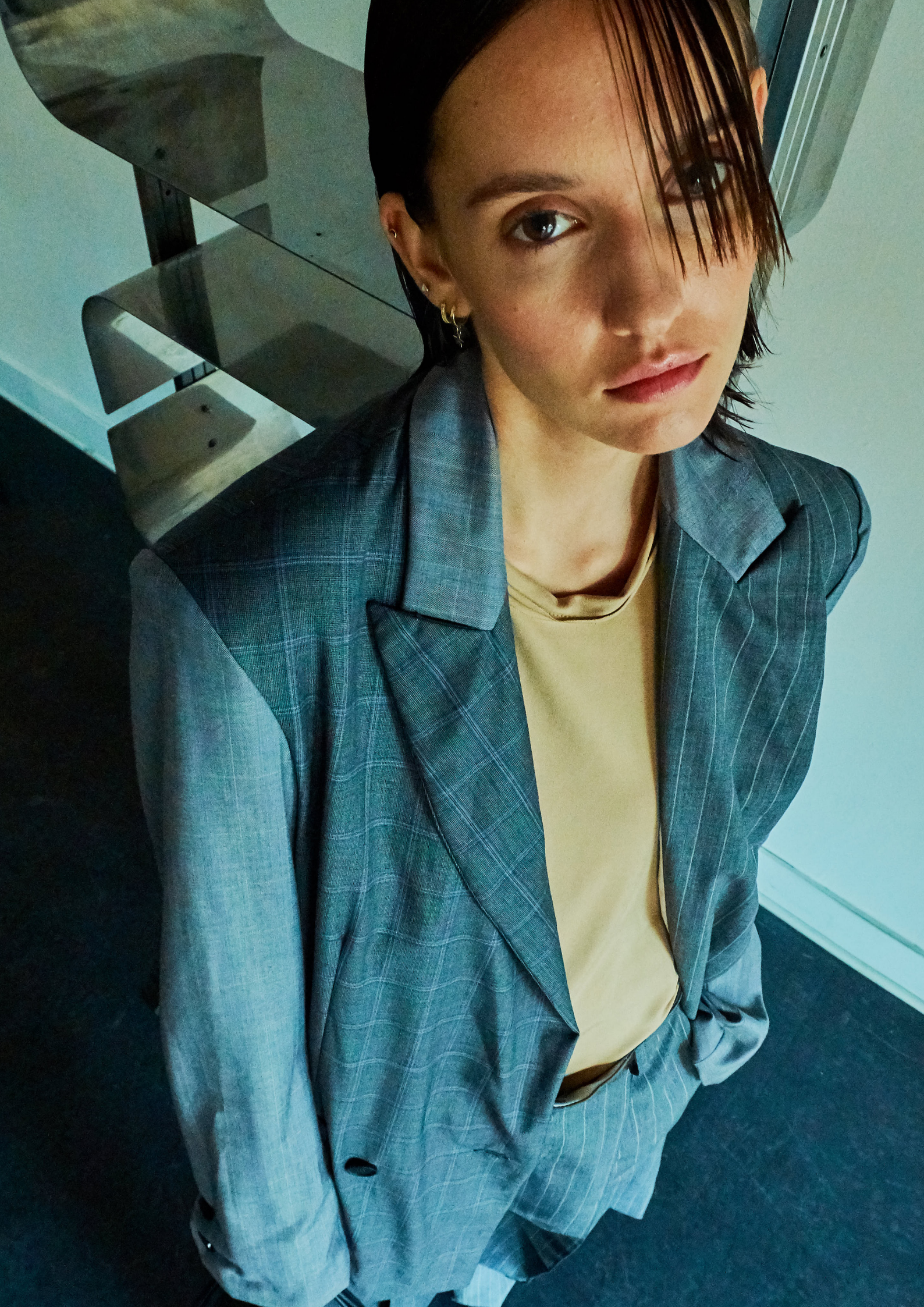
LEFT PAGE Suit and top from Moonyounghee