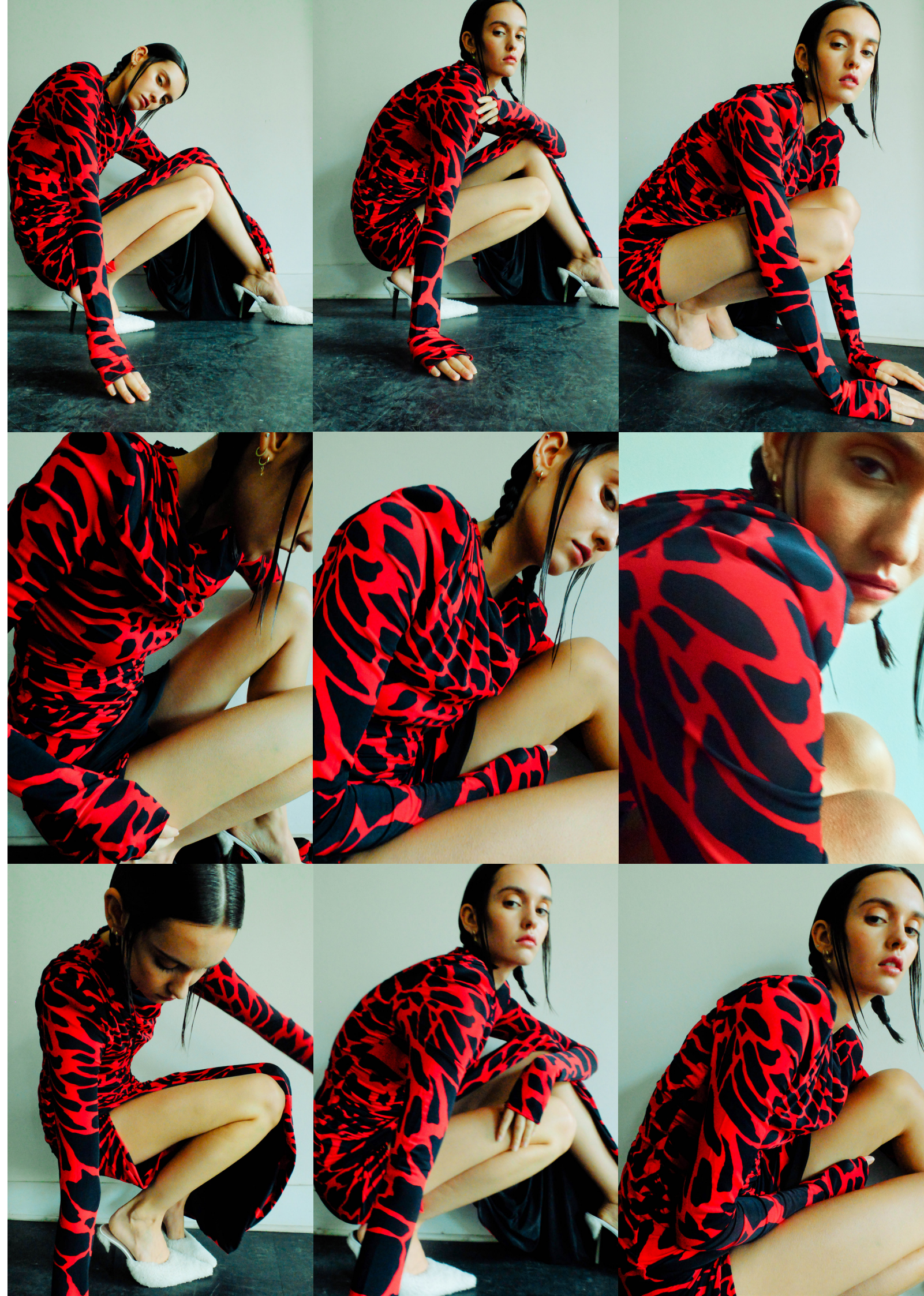
RIGHT PAGE Dress by Alexandre Vauthier Shoes by Fenty