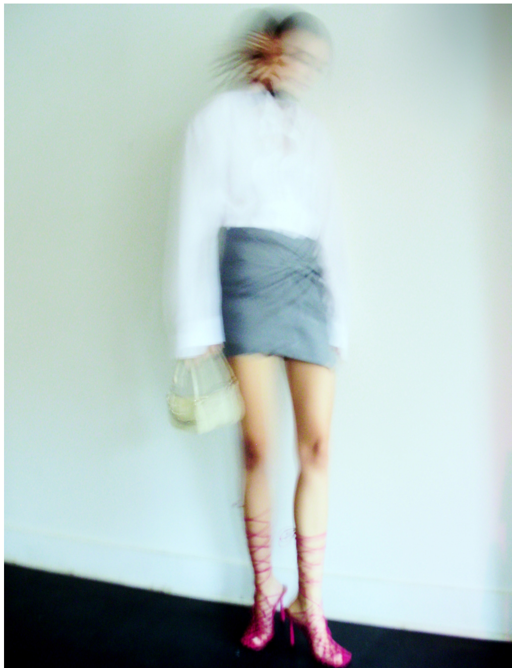
LEFT PAGE Chemise Charvet Jupe Alexandre Vauthier Sac By Far Shoes Fenty